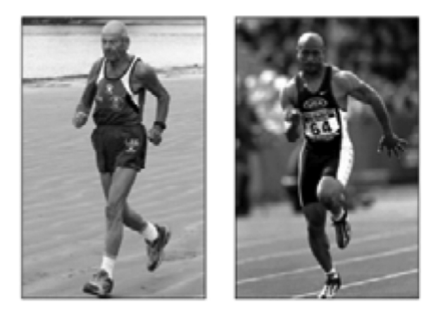
FIGURE 3. Example of an item from Test 1 "easy cognitive."

Next we present the tests designed to fit the aims of the study.