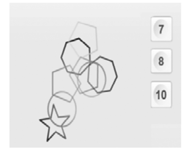
FIGURE 4. Example of an item from Test 2 "difficult cognitive."

subjects to reflect on how to live better and how to grow despite obstacles. In this case, the metaphor was divided into two parts. The first told of painful life experiences with which anyone could identify. In the second, subjects read general sentences about life that did not refer to concrete experiences.